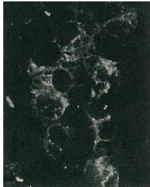
Fig.2 Detection of HCV NS5a protein by immunofluorescence antibody staining. Chimpanzee liver cells were infected with recombinant vaccinia virus containing a HCV genome cDNA. After incubation for 48 hr, the cells were fixed with acetone and HCV NS5a protein was detected by indirect immunofluorescence staining using this antibody.