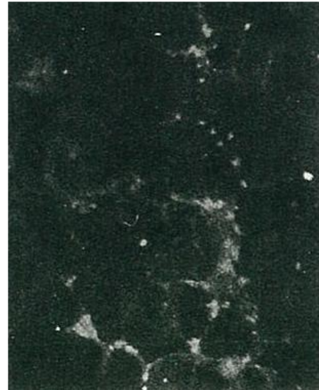
Fig.2 Detection of HCV NS5b protein by immunofluorescence antibody staining. Chimp liver cells were infected with recombinant vaccinia virus containing a HCV genome cDNA. After incubation for 48 hr, the cells were fixed with acetone and HCV NS5b protein was detected by indirect immunofluorescence staining using this antibody.