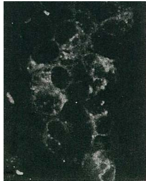
Fig.2 Detection of HCV NS5a protein by immunofluorescence antibody staining. Chimpanzee liver cells were infected with recombinant vaccinia virus containing a HCV genome cDNA. After incubation for 48 hr, the cells were fixed with acetone and HCV NS5a protein was detected by indirect immunofluorescence staining using this antibody.