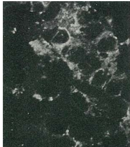
Fig.2 Detection of HCV NS4a protein by immunofluorescence antibody staining. Chimp liver cells were infected with recombinant vaccinia virus containing a HCV genome cDNA. After incubation for 48 hr, the cells were fixed with acetone and HCV NS4a protein was detected by indirect immunofluorescence staining using this antibody.