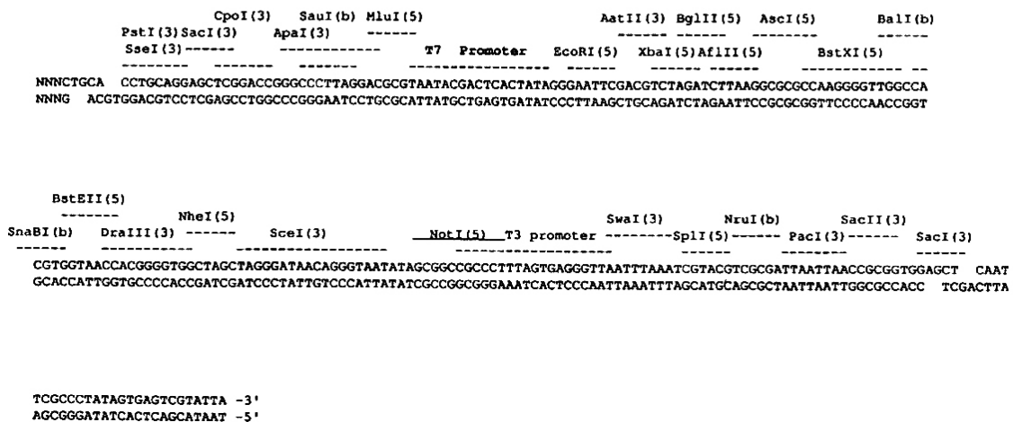
Fig. Structure of pLZ3 and the restriction sites

Ars is the S. pombe region required for replication in S. pombe , and Ori is an origin required for replication in E. coli .