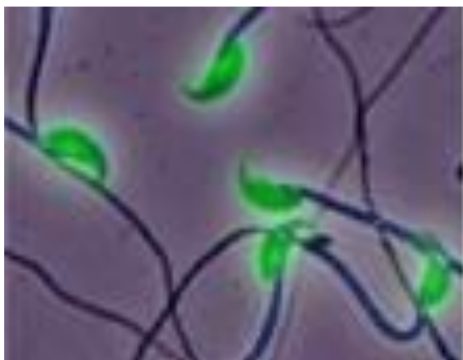
Fig.3 Immunofluorescent staining of ADAM1B in sperm.

Fresh sperm collected from the epididymis of mice were fixed in 4% paraformaldehyde and then immunostained with the anti-ADAM1B antibody (#57) at 1/300 dilution.